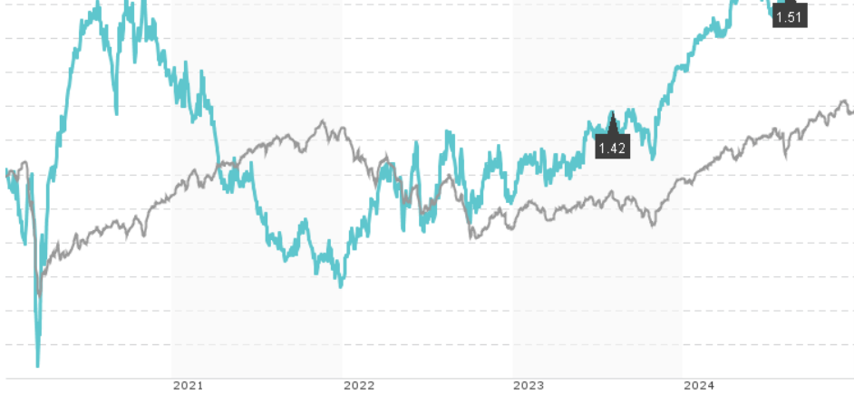
■ TBF Attila Global Opportunity Fund R EUR ■ Benchmark: IX Mischfonds flexibel EUR